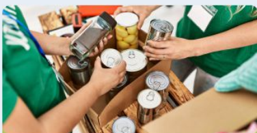
INDUSTRIAL AND TOURISM CATERING