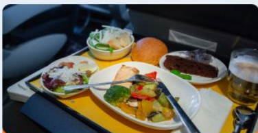
MEALS ON TRAINS