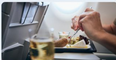
MEALS ON BOARD AIRLINES