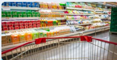
SUPERMARKETS / HYPERMARKETS / GROCERY STORES