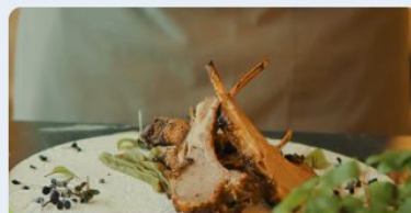
CORPORATE AND INSTITUTIONAL CATERING