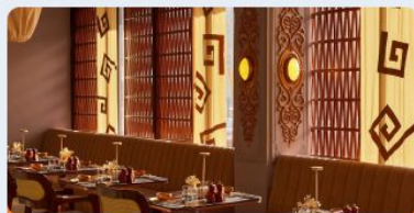
RESTAURANT AND CAFE