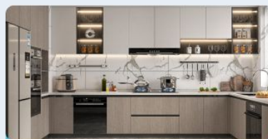
KITCHEN DESIGNERS AND MORE