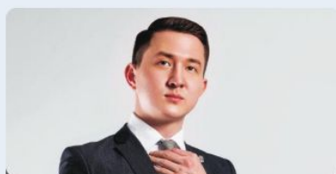
FRANCHISORS AND FRANCHISEES