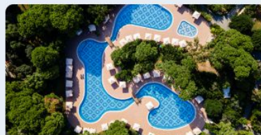
CLUBS AND RESORTS