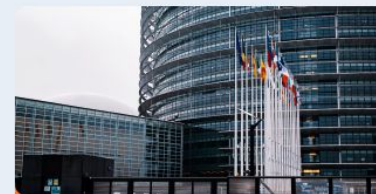
STATE AND TRADE ASSOCIATIONS